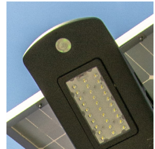
Movement sensors with auto activation