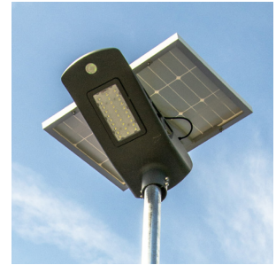
Powerful led lights - use less power for maximum light